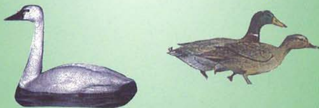
Mute Swan and Mallard

The mud banks along the tidal Crouch provide a rich and vital food source for wading birds. Redshank and oystercatcher can be seen probing for worms and shell-fish and lapwing roost in the sheltered spots. Mute swans, mallard and many other birds are also to be seen.