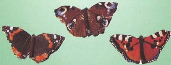
Red Admiral, Peacock and small Tortoiseshell.

AREA c is being developed into meadowland and in the summer has wildflowers such as hoary cress, charlock, ox-eye daisy, cut-leaved cranesbill, dog rose, black mustard, pineapple weed, smooth sow thistle, yarrow, stinking chamomile, corn marigold and common mallow. These flowers attract many varieties of butterflies such as speckled wood, small white, brimstone, orange tip, holly blue, meadow brown and comma.