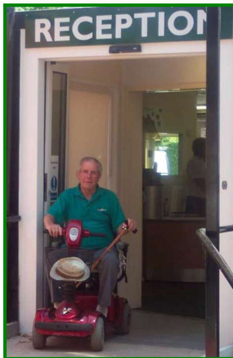
Equality of access - the new reception entrance at Rochford District Council's offices

Rochford District Council firmly believes that members of all the various communities that have an interest in the planning of the district should be able to have their voices heard in the decision making process and will attempt to break down the perceived barriers to involvement. The Council will place special attention on trying to engage with people and groups who may have felt excluded from the process in the past. This will done by a range of methods as outlined in Box 3.