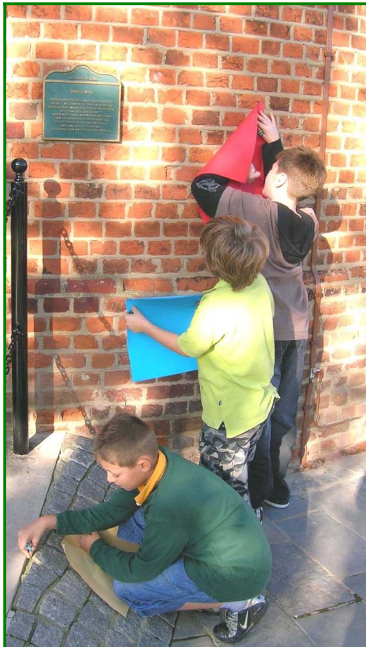
Taking an interest in local history – children at an activity day at Rayleigh Windmill

The Council will monitor the effectiveness of the various community participation exercises that it carries out as part of the review of the Statement of Community Involvement. Information on this will be available to the public in written and electronic format on request. This monitoring will be used to ensure that the Statement of Community Involvement is revised appropriately.