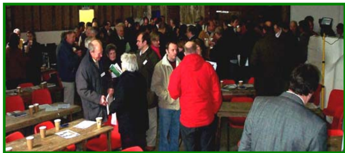
Public meetings - planners talking to the farming community

When applications are made to develop land by the Council, it will be subject to the same minimum requirements as any other applicant and will aim for the maximum level of public engagement appropriate for the type of development proposed, as outlined in Table 3. In any event this will be at or beyond the level required by legislation. When Rochford District Council is the applicant it will explore the possibility of delegating a significant level of power over development to people who will be most affected by it.