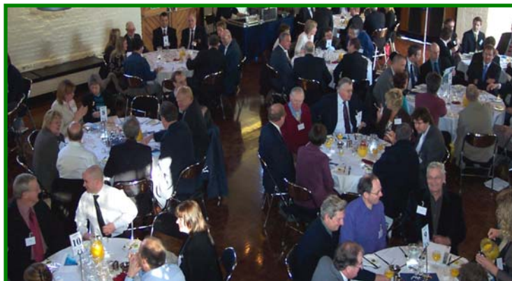
Breakfast event for local businesses