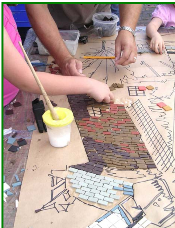
Children working on a mosaic depicting Rayleigh Windmill