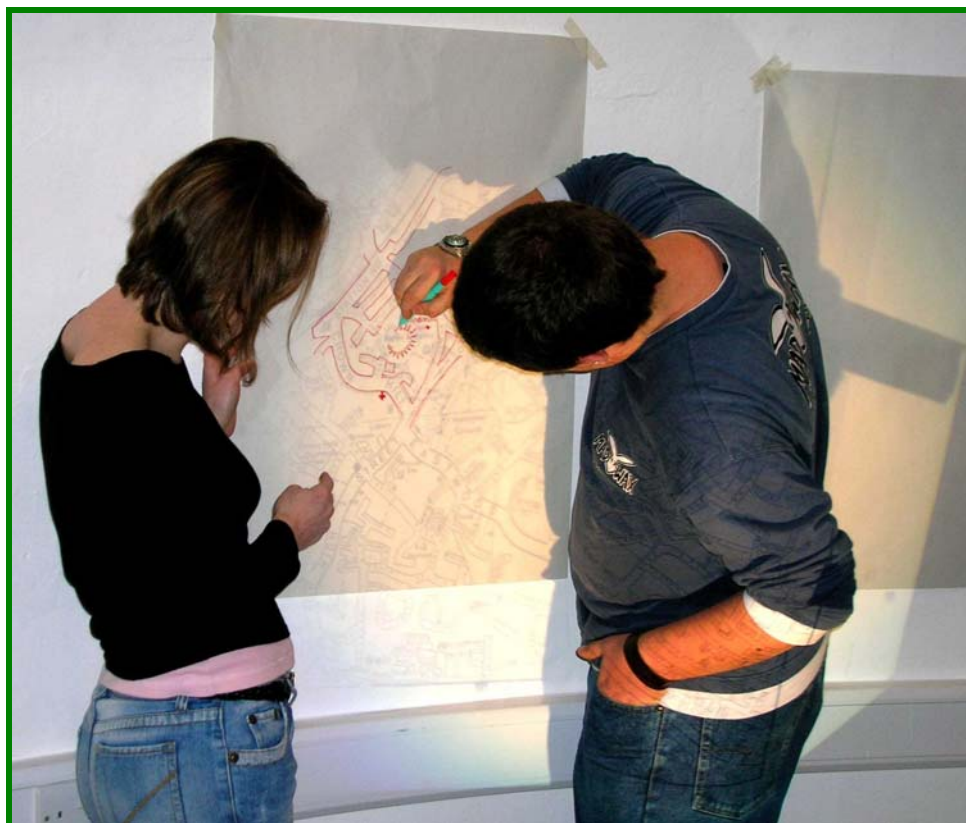
It's not just about filling in questionnaires

Planning Aid is an organisation that provides independent planning advice free of charge and is a valuable resource to those who may not otherwise have access to a planning consultant. Rochford District Council will promote the use of Planning Aid to members of the public as a way of helping people to understand planning and as a vehicle through which they can voice their views. Details of how to contact Planning Aid can be found under 'Useful Contacts' section of this document (see page 27)