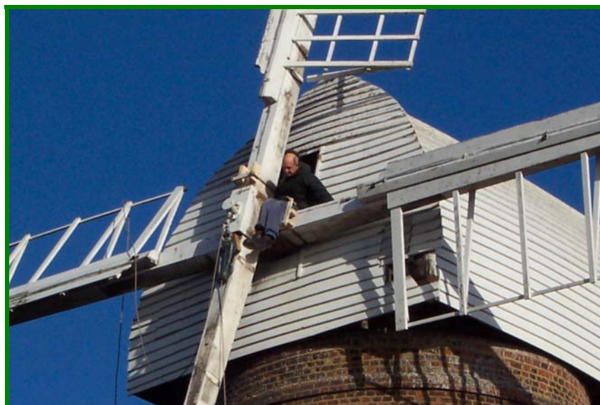
Award-winning conservation work being undertaken at Rayleigh Windmill

The following sections explain how and when people can get involved in the various different areas of planning: the Local Development Framework ; Planning Applications ; pre-application discussions ; and Enforcement . These sections also outline how the Council will encourage and enable people to participate fully.