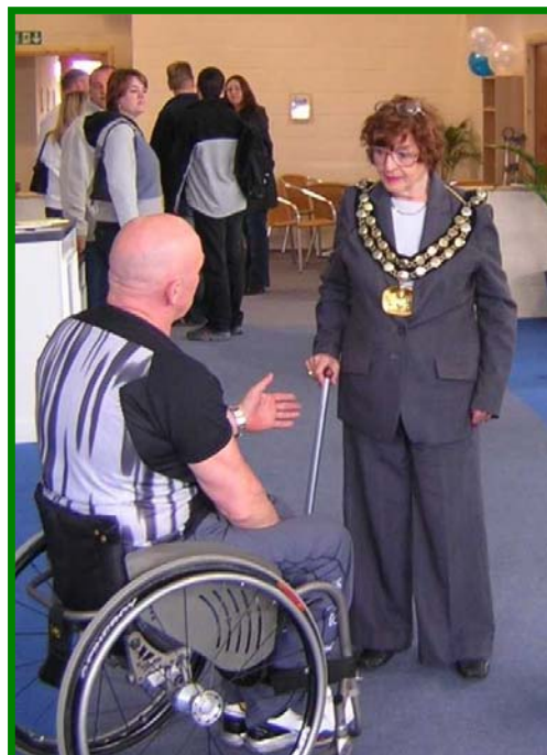
Listening to the public's views

The Statement of Community Involvement takes account of the policies, programmes and strategies prepared by Rochford District Council. It will be amended as necessary as new documents and legislation dictate. Other documents produced by Rochford District Council can be found on the Council's website or they can be viewed at the Council's reception.