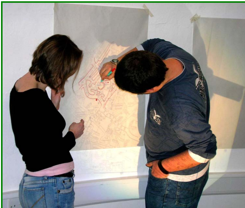
It's not just about filling in questionnaires

Planning Aid is an organisation that provides independent planning advice free of charge and is a valuable resource to those who may not otherwise have access to a planning consultant. Rochford District Council will promote the use of Planning Aid to members of the public as a way of helping people to understand planning and as a vehicle through which they can voice their views. Details of how to contact Planning Aid can be found under 'Useful Contacts' section of this document (see page 27)