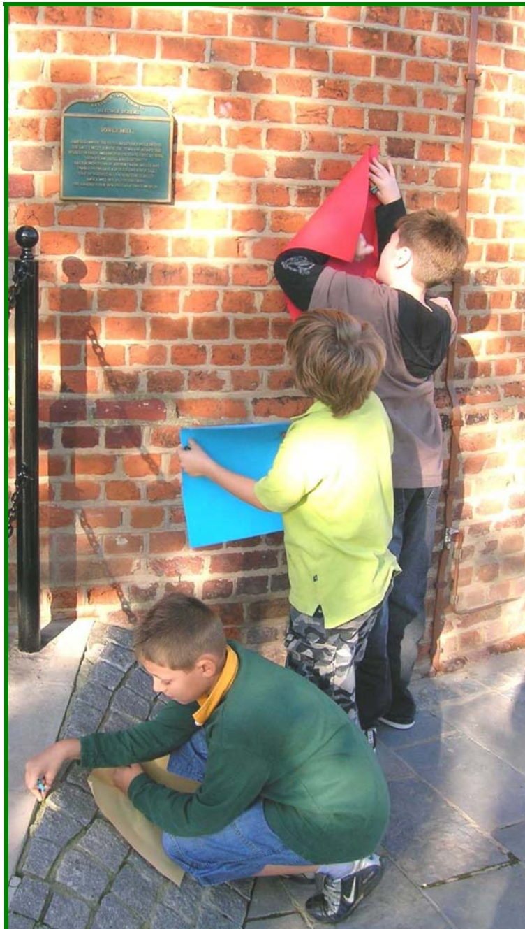
Taking an interest in local history – children at an activity day at Rayleigh Windmill

The Council will monitor the effectiveness of the various community participation exercises that it carries out as part of the review of the Statement of Community Involvement. Information on this will be available to the public in written and electronic format on request. This monitoring will be used to ensure that the Statement of Community Involvement is revised appropriately.