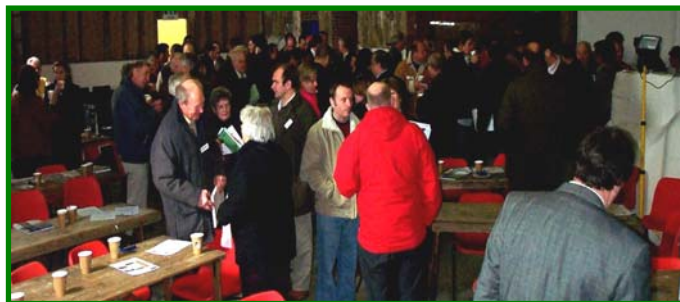
Public meetings - planners talking to the farming community

When applications are made to develop land by the Council, it will be subject to the same minimum requirements as any other applicant and will aim for the maximum level of public engagement appropriate for the type of development proposed, as outlined in Table 3. In any event this will be at or beyond the level required by legislation. When Rochford District Council is the applicant it will explore the possibility of delegating a significant level of power over development to people who will be most affected by it.