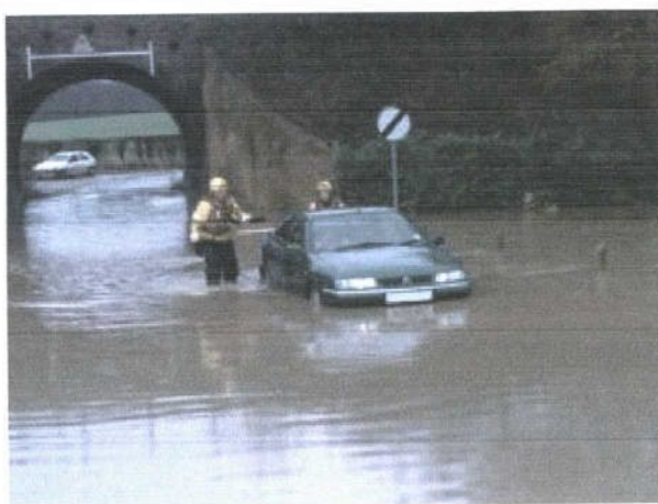
Crews help the woman in Ingatestone.

MOTORISTS faced treacherous driving conditions today because of flooding.