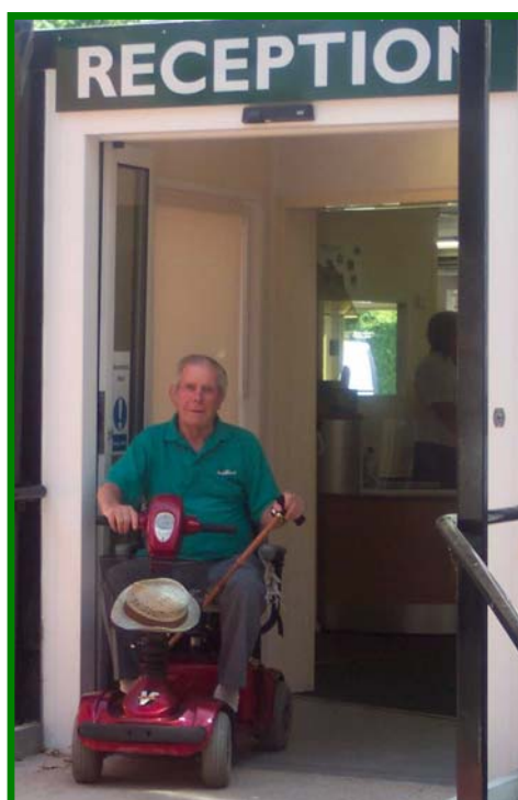
Equality of access - the new reception entrance at Rochford District Council's offices

Rochford District Council firmly believes that members of all the various communities that have an interest in the planning of the district should be able to have their voices heard in the decision making process and will attempt to break down the perceived barriers to involvement. The Council will place special attention on trying to engage with people and groups who may have felt excluded from the process in the past. This will be done by a range of methods as outlined in Box 3.