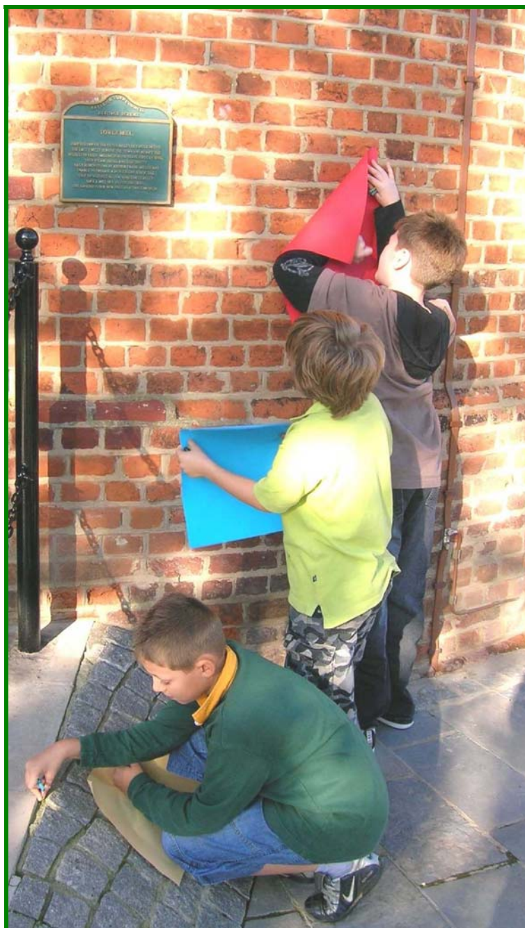
Taking an interest in local history – children at an activity day at Rayleigh Windmill

The Council will monitor the effectiveness of the various community participation exercises that it carries out as part of the review of the Statement of Community Involvement. Information on this will be available to the public in written and electronic format on request. This monitoring will be used to ensure that the Statement of Community Involvement is revised appropriately.