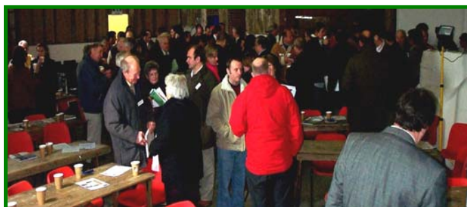
Public meetings - planners talking to the farming community

When applications are made to develop land by the Council, it will be subject to the same minimum requirements as any other applicant and will aim for the maximum level of public engagement appropriate for the type of development proposed, as outlined in Table 3. In any event this will be at or beyond the level required by legislation. When Rochford District Council is the applicant it will explore the possibility of delegating a significant level of power over development to people who will be most affected by it.