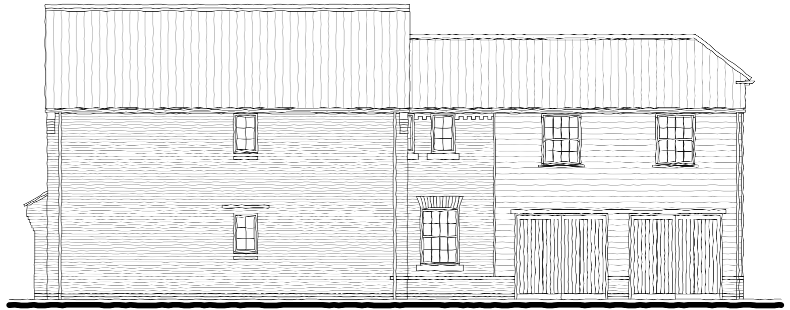
Front Elevation 2