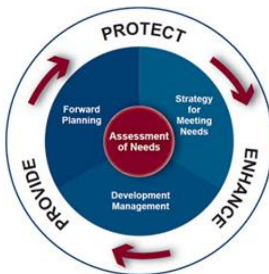
Figure 2.1: Sport England themes

To provide new outdoor sports facilities where there is current or future demand to do so.