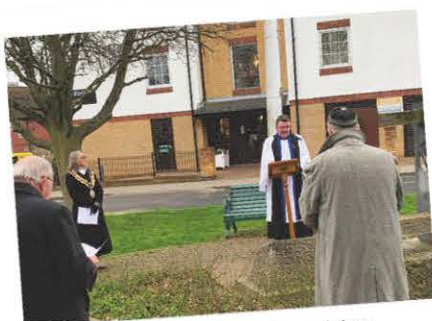
Holocaust Memorial Day flag raising

I have particularly enjoyed being invited to support local businesses just starting back after the pandemic. One such promotional event involved Nana Cha Cha's, a small café in Hullbridge. The building was brought back to life and renovated following the last national lockdown and has contributed to the local economy by moving the business into the district.