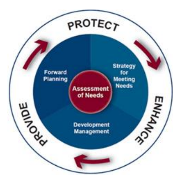
Figure 2.1: Sport England themes

To provide new outdoor sports facilities where there is current or future demand to do so.