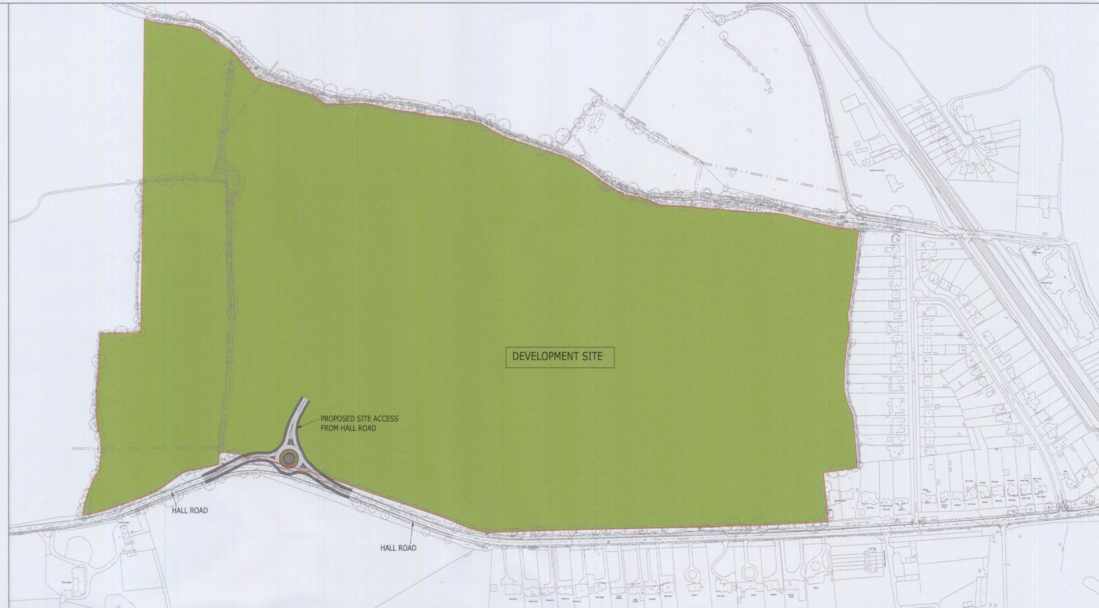
SITE LOCATION PLAN SCALE 1:2500

REPRODUCED FROM ORDNANCE SURVEY © BY THE PERMISSION OF THE CONTROLLER OF HER MAJESTY'S STATIONERY OFFICE. © CROWN COPYRIGHT. ALL RIGHTS RESERVED. LICENCE NUMBER 100044561